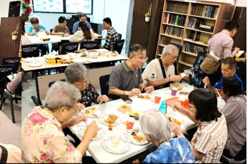
Annual Congregation Meeting & Lunch Fellowship.