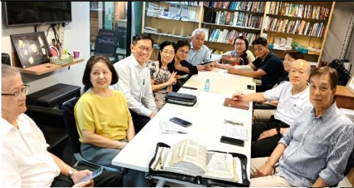
Sunday School Class - Christian Apologetics by Pastor.