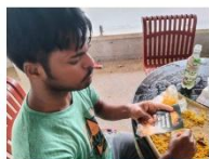
Local Evangelism - Macpherson Estate: SHBPC Fishing Ground