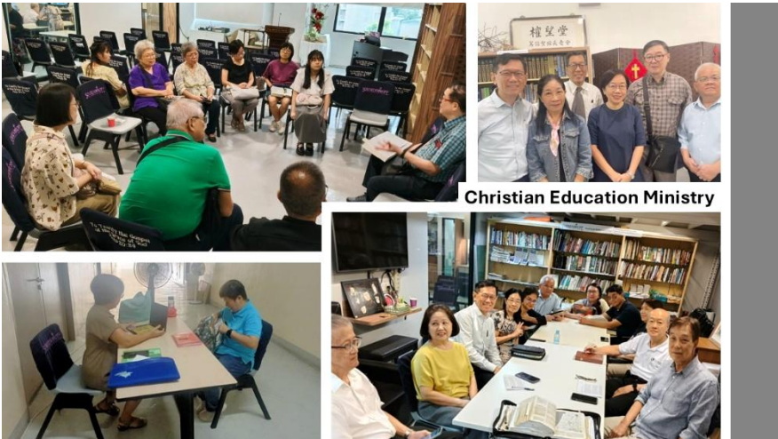
Christian Education Ministry