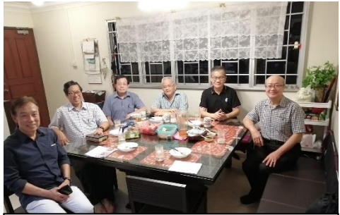
Dinner Fellowship at Pastor's home.

Those who fear the Lord also thought upon His name. What saturates our mind? What consumes our energy and time? Is it money, work, leisure, pets, plants, pastimes, or our children? The frenzy of the World Cup in France caused a drastic loss of many man-hours world-wide. Even Presidents and Congressmen postponed national business meetings to watch their country played against another in football games as was reported in the news. Christians are not spared of this addiction. We have to be vigilant and to watch against excesses in our lives. If there is one addiction that is acceptable to God, it is the addiction to the ministry of saints (1 Cor 16:15). When we are so enthralled and zealous about blessing and edifying God's people and to pray and seek God together in corporate intercession, the Lord will hear and will definitely bless and prosper our time together.