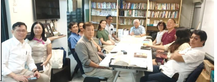
Sunday School Class on "How to Study the Bible"