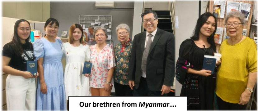
Our brethren from Myanmar ....