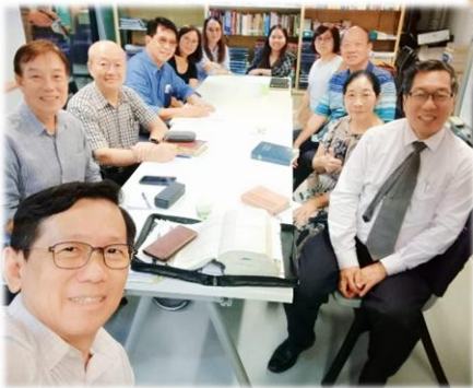
Sun Sch Class: Walking Through the Old Testament by Pastor