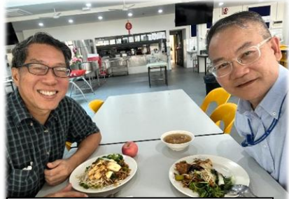
Weekday Lunch Fellowship