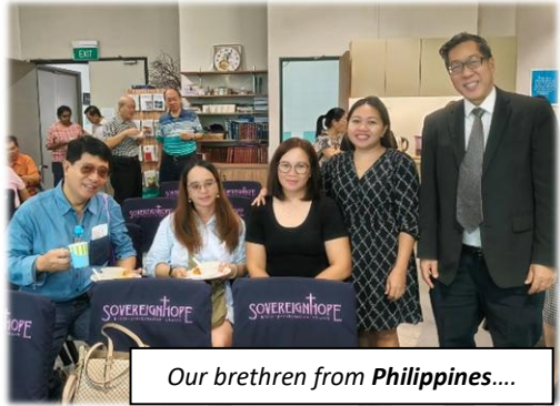
Our brethren from Philippines ...