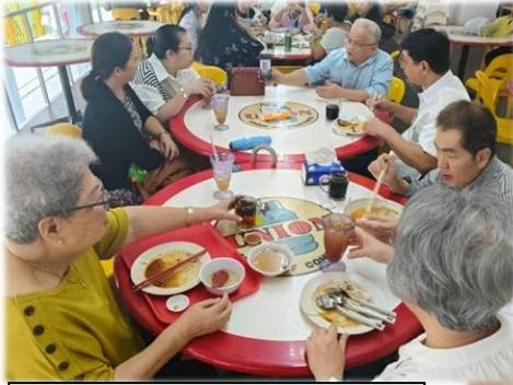
Sunday Lunch Fellowship