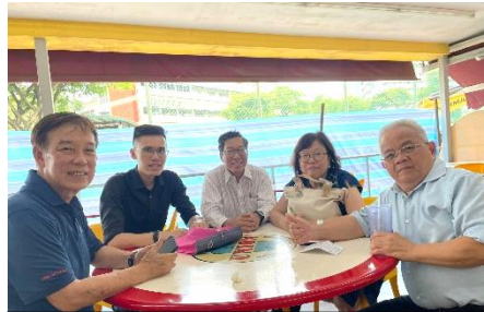
Evangelism Team on 23 Jun 2024 @Macpherson Estate