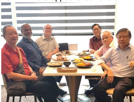
Meeting with the leaders of the Gideon Bible Society. Do uphold their ministry in much prayer.